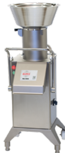
RG-400i with Feed Hopper

The Feed Cylinder for the Feed Hopper is designed with two feed compartments that press the product down against the cutting tool during preparation.