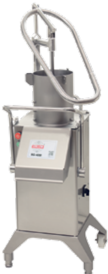
RG-400i with Manual Push Feeder

Feed Cylinder B with one internal wall is used for the Manual Feeder or the 4-tube insert. It is ideal for manually orienting products (stacking) for achieving appropriate cutting direction.