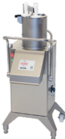
RG-400i with 4-tube insert