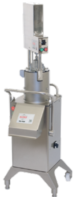
RG-400i with Pneumatic Push Feeder