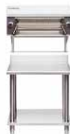
CS9 / C900-S