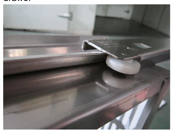
C. Lift drawer and remove from channel.